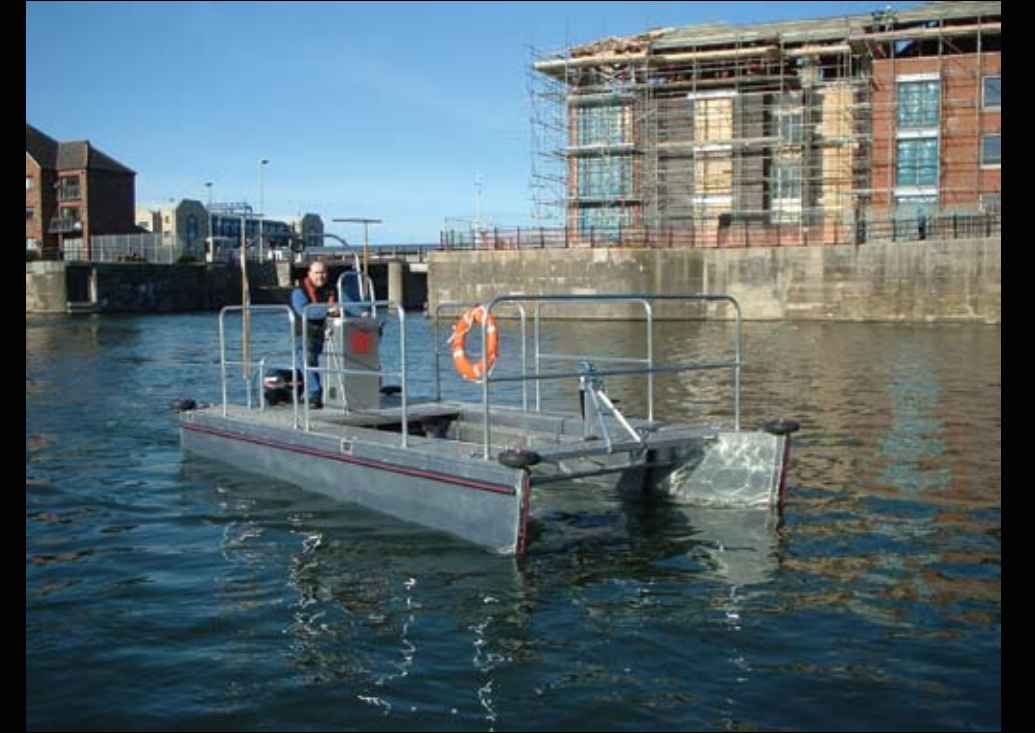
Liverpool Water Witch