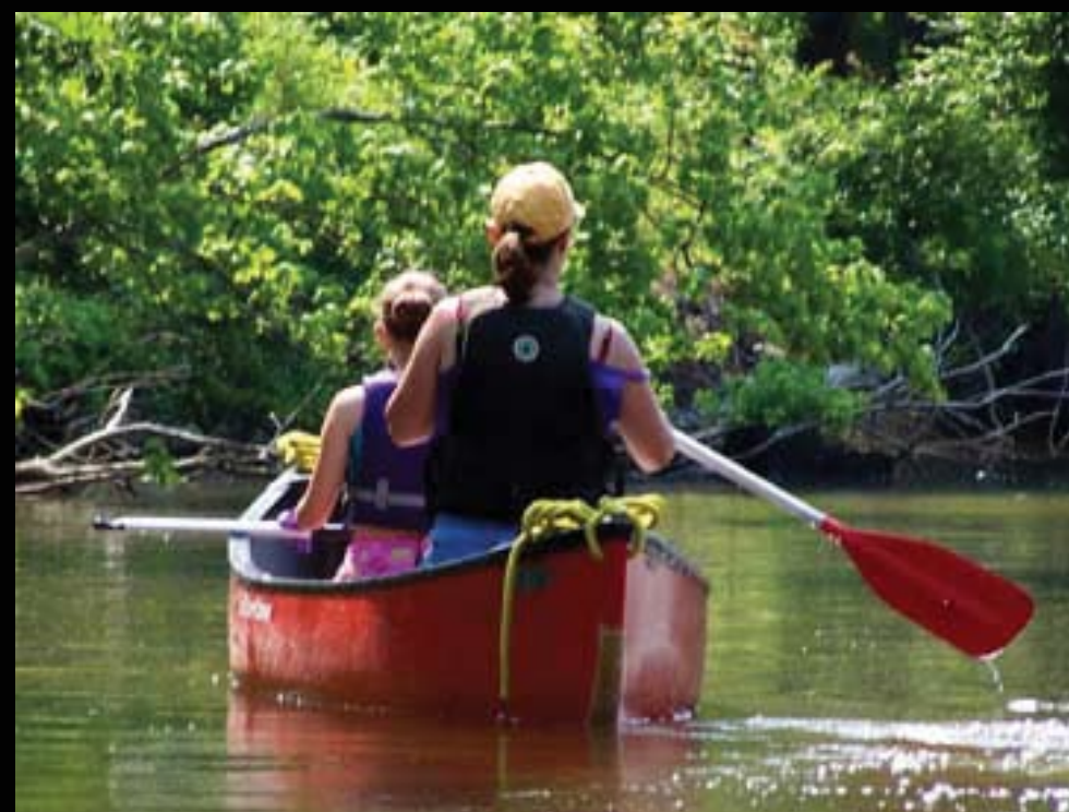
Old Fashioned Canoe

The most widely used methods incorporate people, usually volunteers, working in debris recovery efforts.