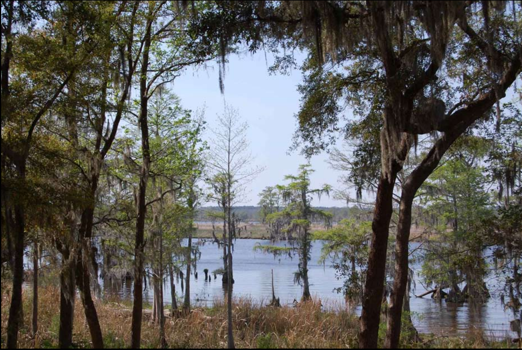
Targeted areas, Inland waterways and lakes Georgetown SC vicinity, Photo courtesy of Nikon, Pictoretown

Empirical observations indicate that a large amount of trash exists near human pathways. Similar to the banks of a highway, aquatic debris exists along bodies of water near human populations.