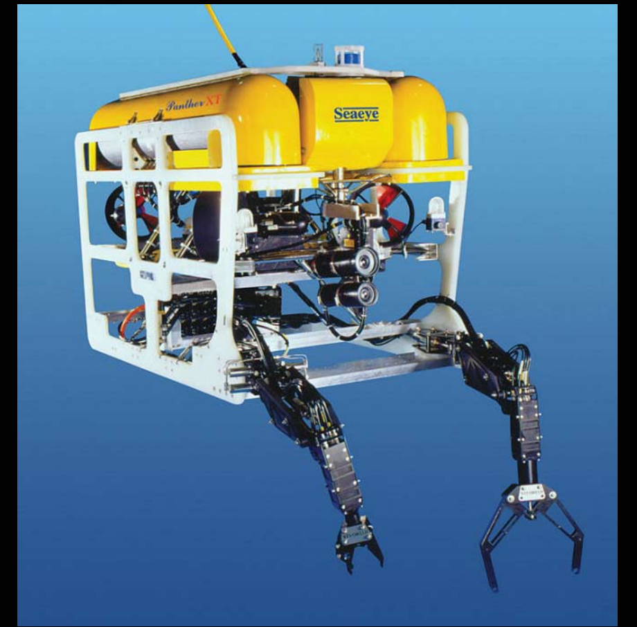
R/V Hercules shown with PantherXT ROV for archeological studies