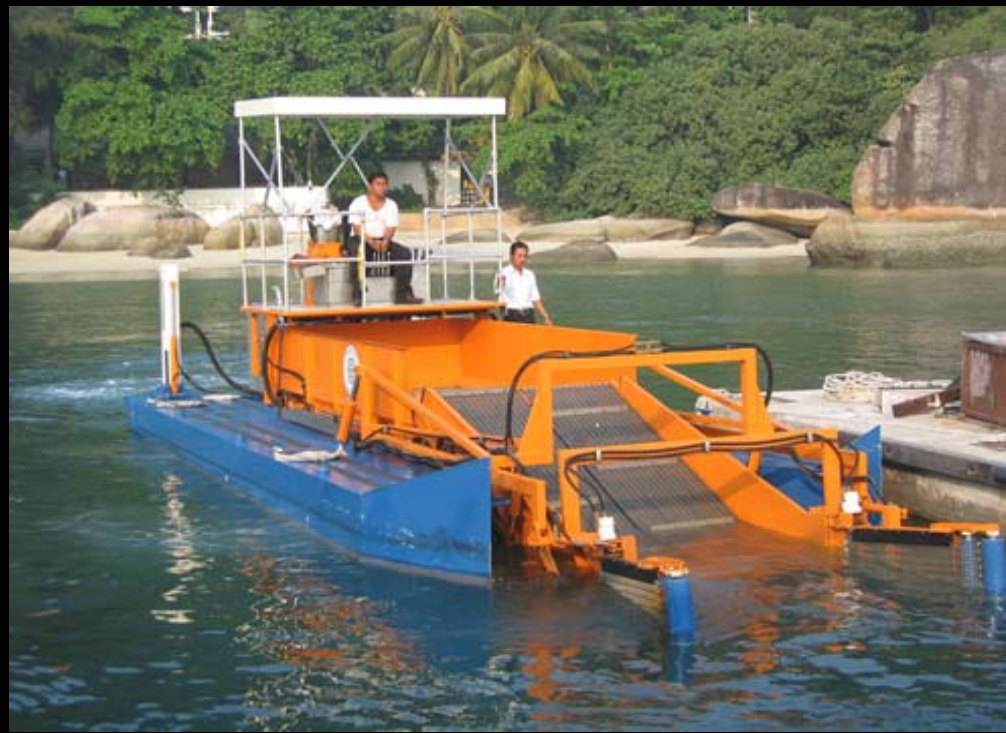
Alpha Boats Marina Cleaner